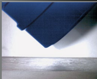
Drop test: 30 l PLUS KEG, full Height 120 cm, angle 45°