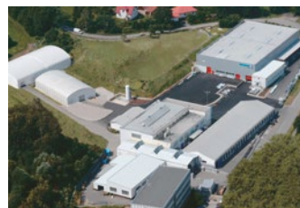
Plant Ledec nad Sázavou Czech Republic