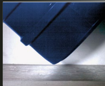
Impact resilience: the PLUS KEG remains undamaged