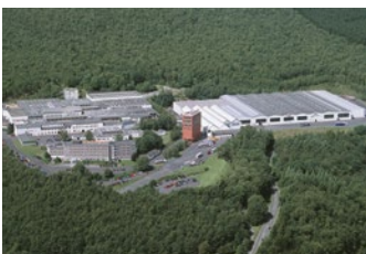
Plant Neunkirchen Germany