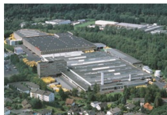
Plant Betzdorf Germany