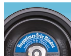
■ Inmould Labelling