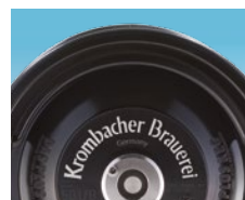
■ Inmould Coating