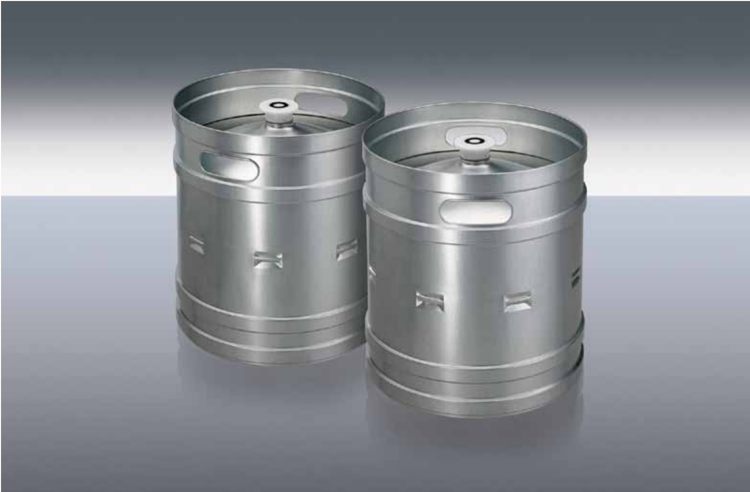
One-way flat-type fitting