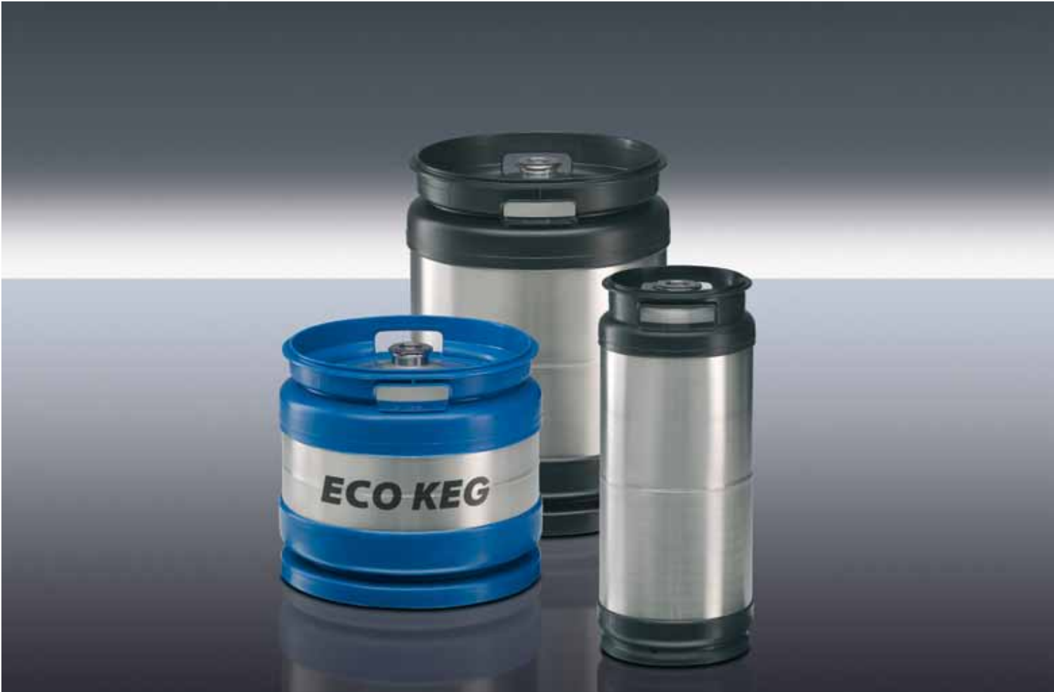
All types of fittings and necks