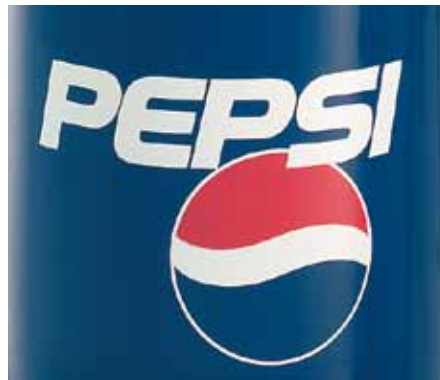
In-mould labelling on PU KEGs