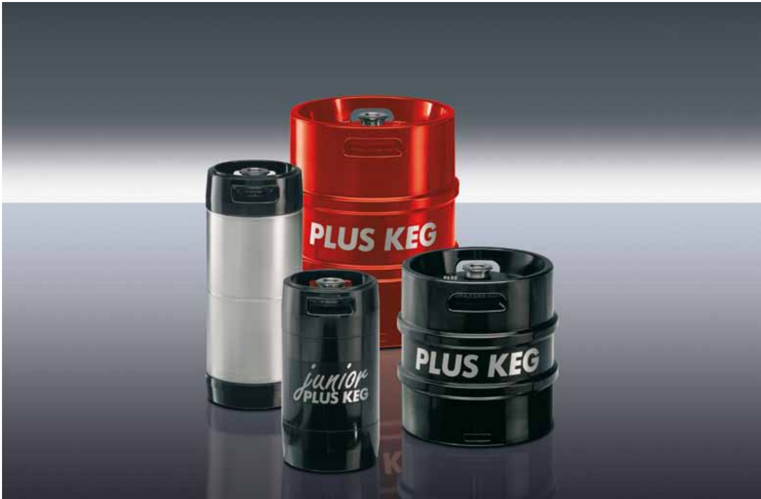
All types of fittings and necks