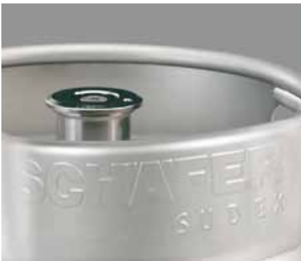
Top-ring embossing on stainless steel KEGs