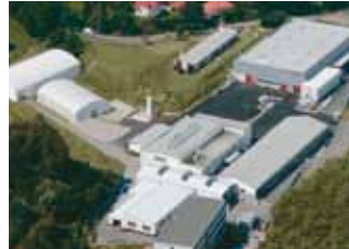
Plant Ledec nad Sázavou (CZ)