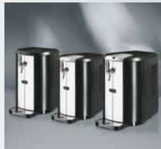
smartDRAFT™ MINI, STANDARD and TROPICAL