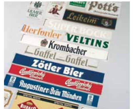
Logos applied for all brands, even logo changes are possible